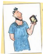
Corinthus is a Greek slave.

Within the Roman Empire, it was common for the rich to have slaves. What can you tell about the slaves below from the pictures?