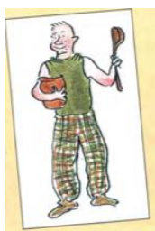
Candidus is a British slave.