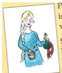
Pandora is a slave girl.