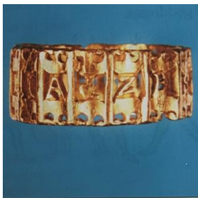
A betrothal ring

In this chapter, we will be exploring the idea of betrothal and marriage within ancient Roman culture.