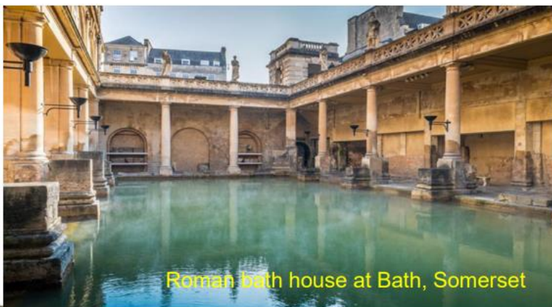
Roman bath house at Bath, Somerset

Some baths were so big they had multiple hot and cold baths. They also might have a library, a food service, a garden and a reading room!